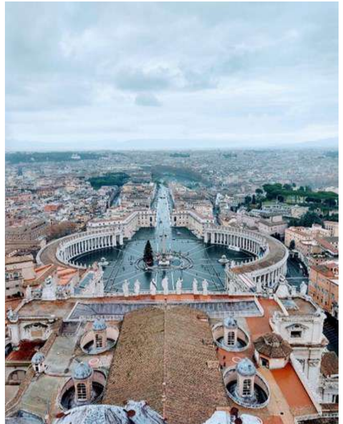
The view from the top by Christian!