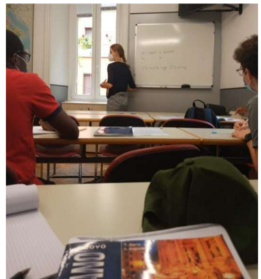
L'inizio Della Lezione