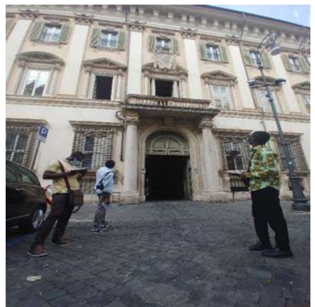
The Church of the Immaculate Conception