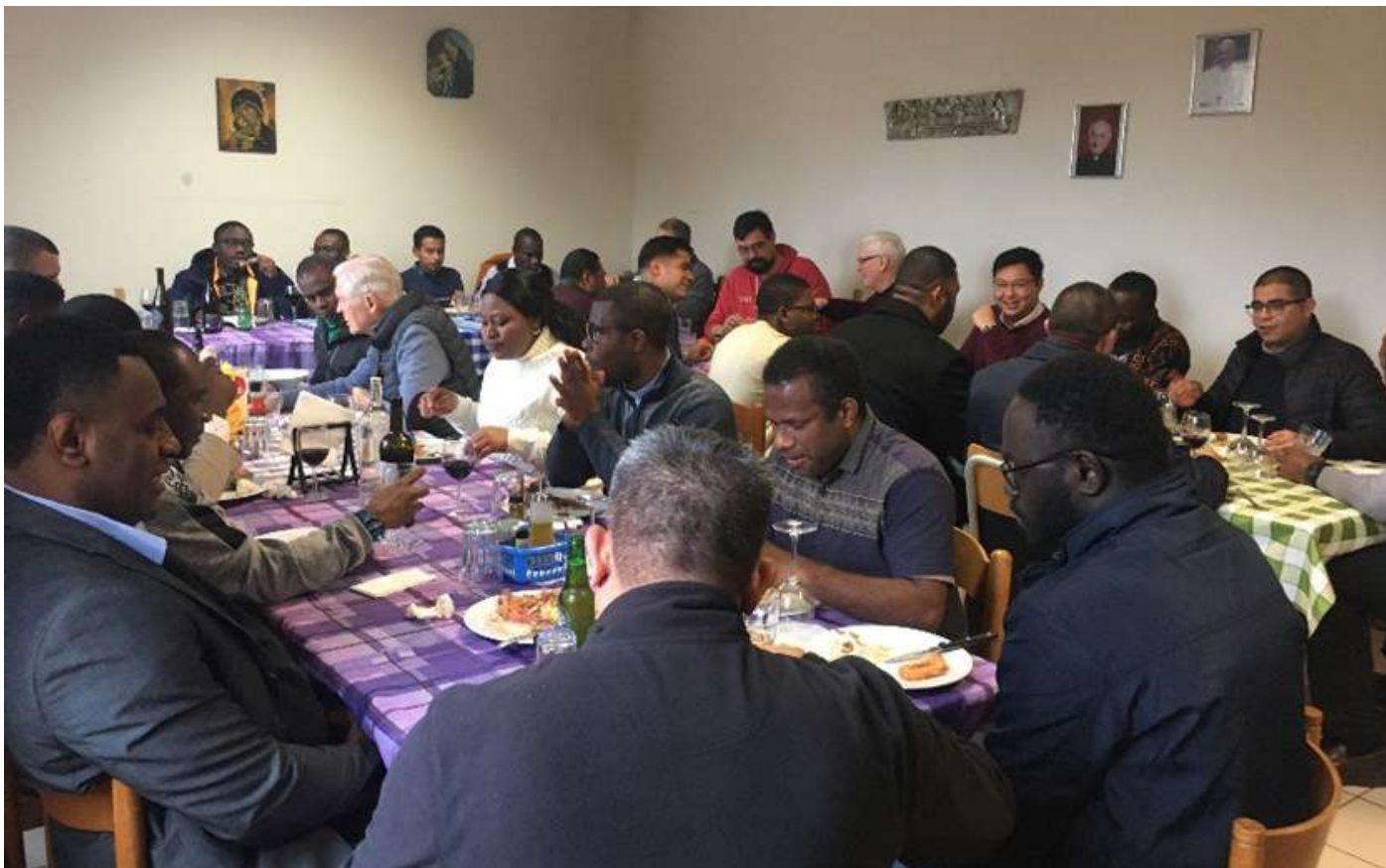
A full house for Christmas lunch