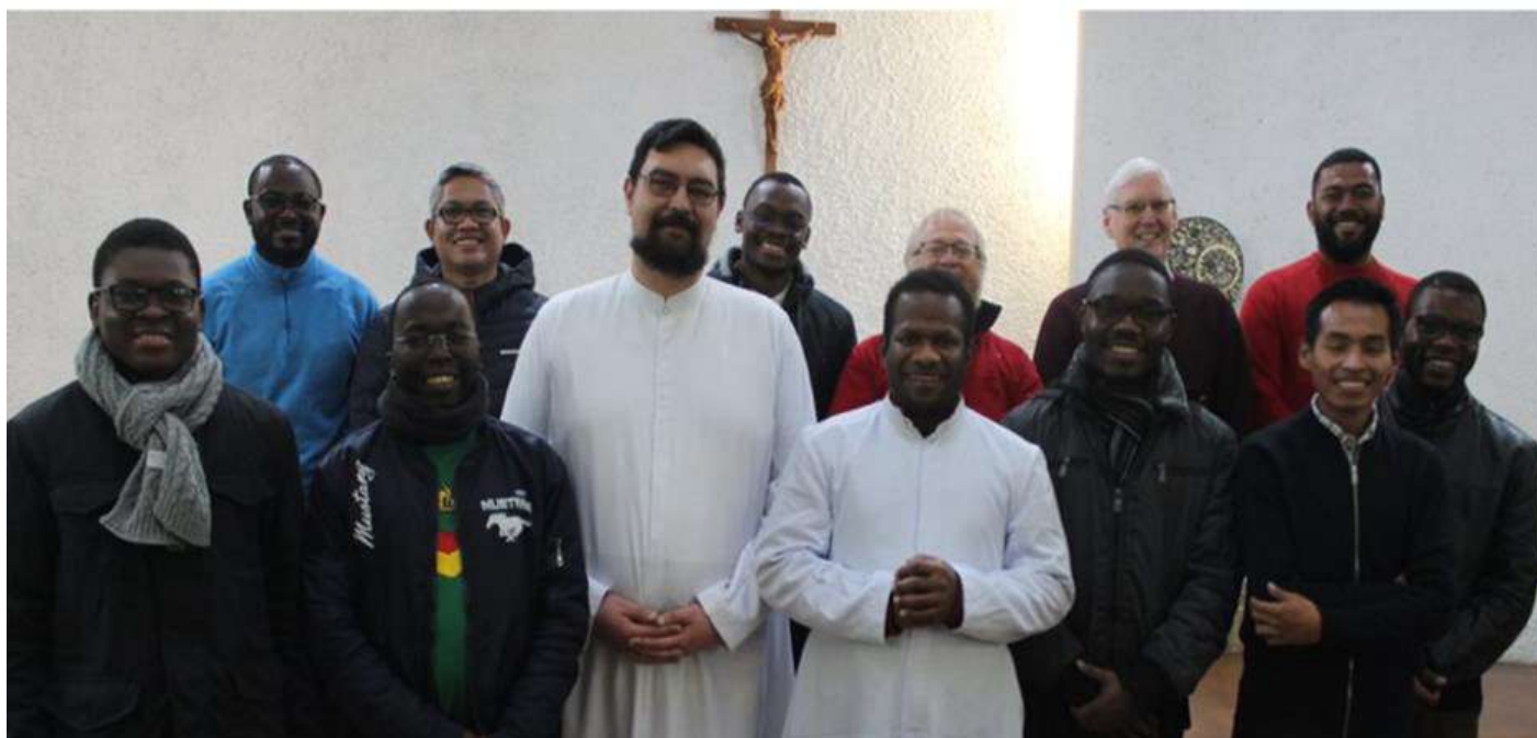
Casa di Maria community January 2022

Bulletin of the Marist International Theologate, March 2022