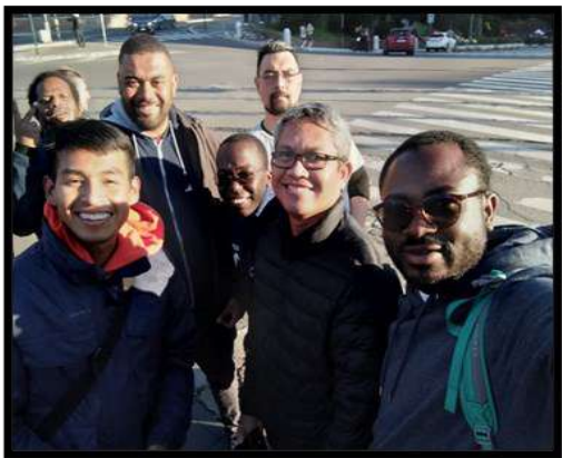
The chefs for Christmas