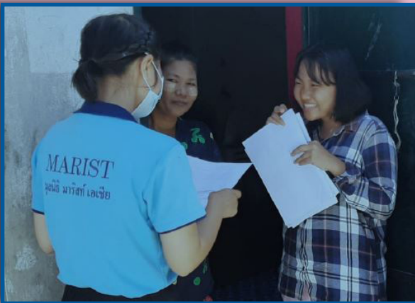
Above and Left: A welcome visit during COVID

The MAF Health Team conducts family visits to provide HIV Testing & Support, health education, counselling, medical support, nutrition and especially care and compassion.