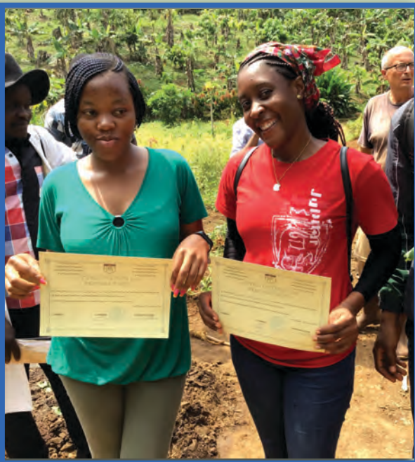
A Future with Hope

Left: Twenty young people have graduated with a 'Certificate of Professional Competence'. These young people who all come from poor villages will now return to their home communities to set up a community based Agri-Poultry project.