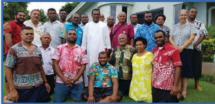
A time for prayer during Covid-19

The prayer centre is an oasis for the people of Suva and this is especially so during the time of Covid-19. After the initial shock of lockdown in the first part of the year, there was an increasing demand for retreats and days of reflection. People from all parts of the community were seeking spiritual nourishment, including families, lectors and Eucharistic ministers, lay people, priests and religious. The ministry of meditation in schools also continued during 2020.