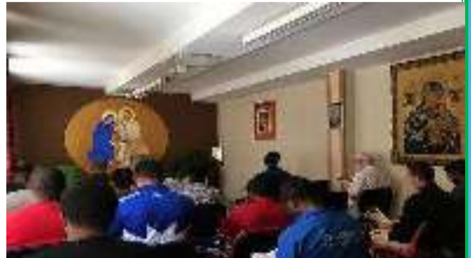
Visitazione eucaristica ordina e preghiera per i confratelli decevuti

D'altronde, a noi religiosi ci ha toccato affrontare la pandemia in un altro modo, ribadendo ancora di più la vocazione a cui siamo stati chiamati. Talvolta pensiamo alle opere di carità fisiche e ci dimentichiamo che pure la nostra intercessione dinanzi Dio può raggiungere ai più vulnerabili. Infatti, non abbiamo smesso di pregare ogni giorno e di celebrare l'Eucaristia in comunità nella nostra piccola cappella e pregare per il mondo nonostante le distanze.