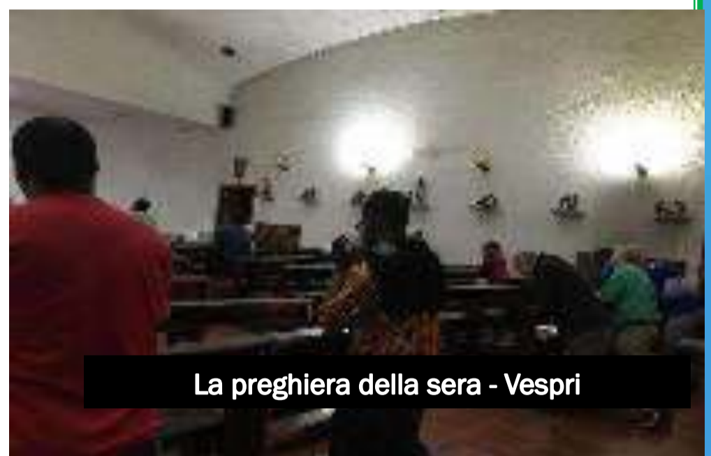
La preghiera della sera - Vespri

Il confinamento rigido in Italia ha finito per il momento. Siamo ancora in tempi incerti e sfidanti, ma siamo invitati ad affidarci nel Signore, a rimanere fedeli e a continuare a pregare per coloro che ancora sono colpiti dalla pandemia. La crisi che sperimentiamo ancora può essere una opportunità per riflettere come gestiamo le nostre vite e che cosa ne sia priorità. Senza la vita di preghiera agiamo meccanicamente, ma con essa le nostre prospettive cambiano e possiamo fare di più.