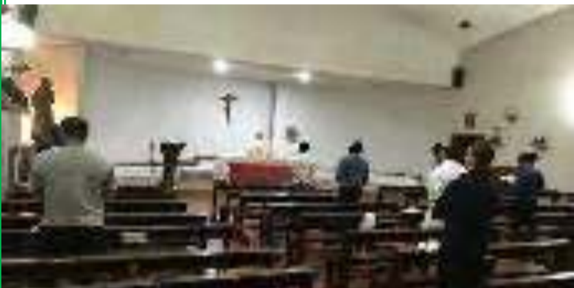
La comunità reunita per la preghiera del Lodi mattutine

La preghiera ci ha fatto anche vedere la realtà con altri occhi. Il cristiano non può vantarsi di esserlo se non vive nella speranza del Signore. Il nostro Superiore Generale ci fornì di una bella preghiera per chiedere la salute in questo tempo. La salute arrivò, comunque, per esempio nella nostra vita comunitaria che vide un miglioramento nei rapporti fraterni e nella generosità del servizio e della pazienza fra di noi.