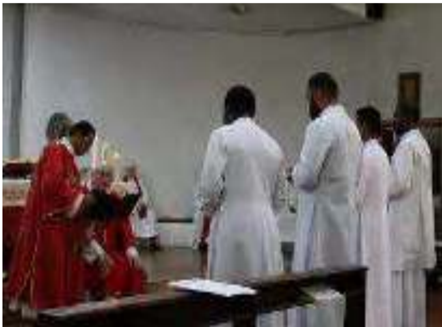
Prayer of blessing for Acolytes