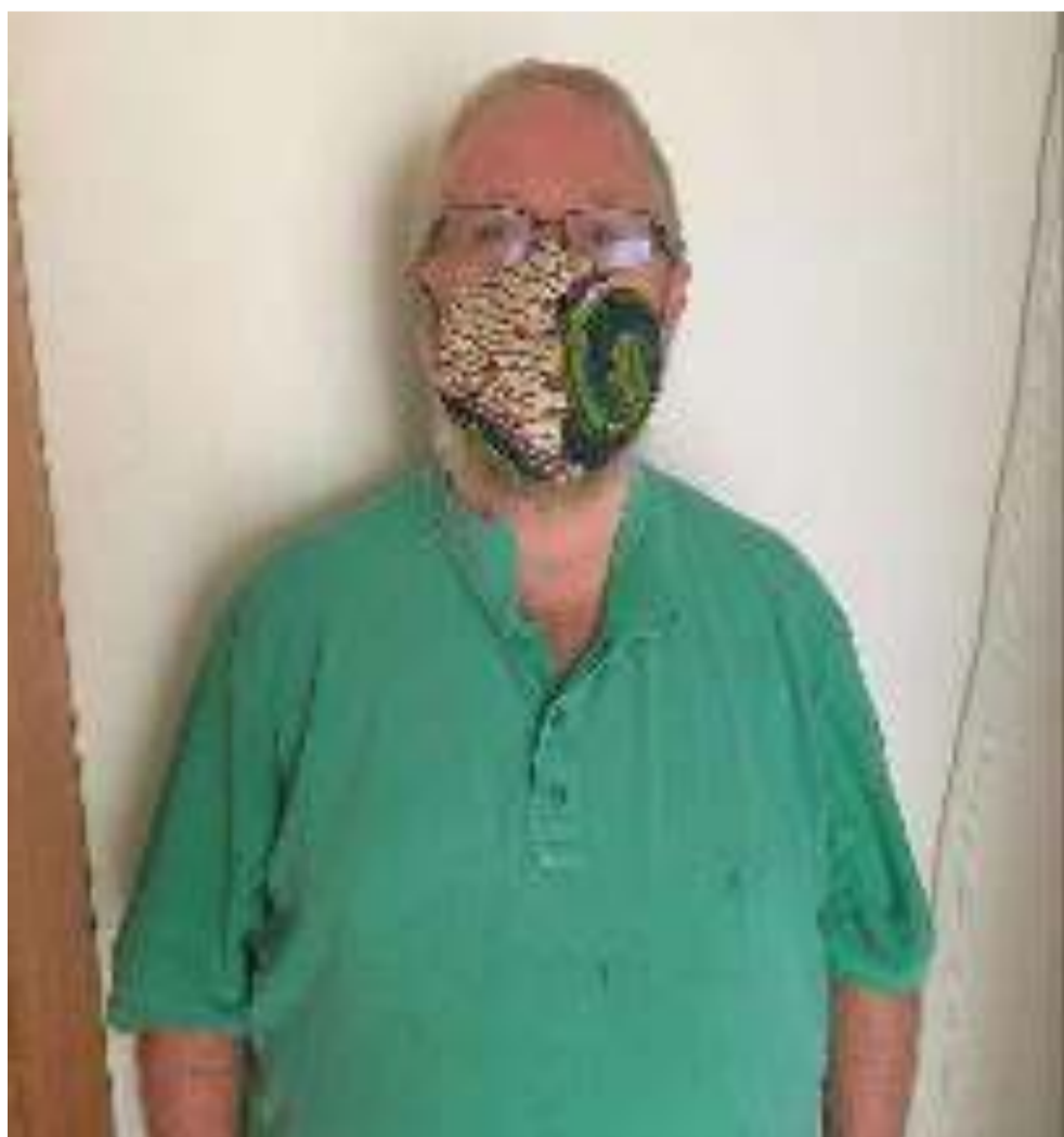
Father Superior too was not left out.