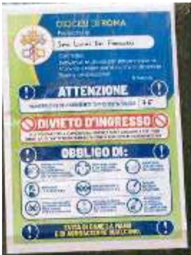
Rules for entering a church