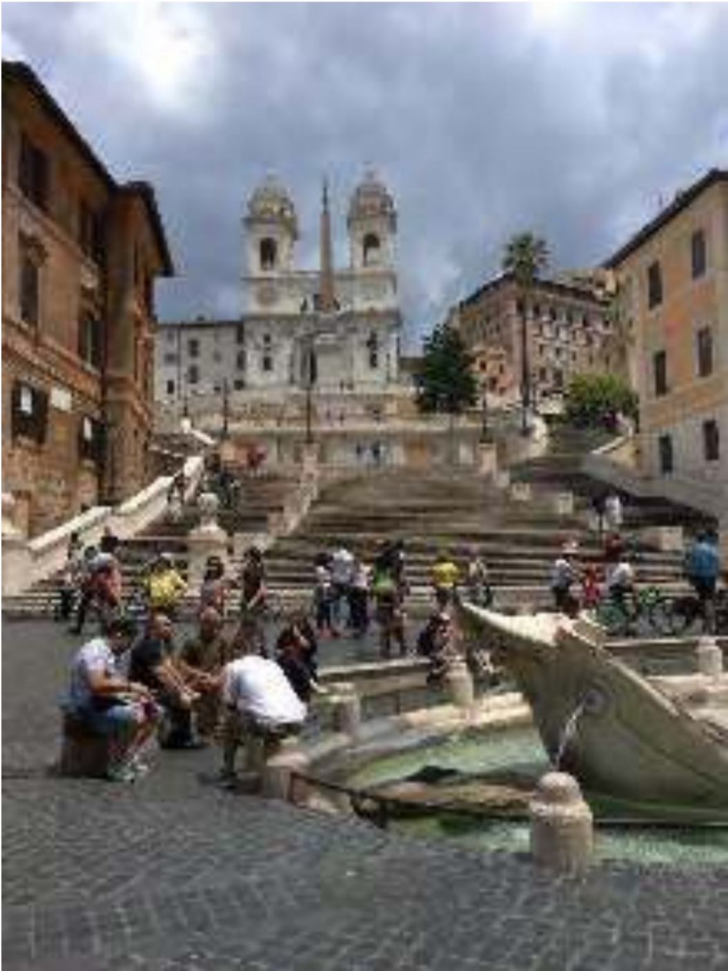
Empty streets of Rome