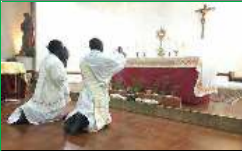
Adorazione e vepres—domenica sera

D'altronde, a noi religiosi ci ha toccato affrontare la pandemia in un altro modo, ribadendo ancora di più la vocazione a cui siamo stati chiamati. Talvolta pensiamo alle opere di carità fisiche e ci dimentichiamo che pure la nostra intercessione dinanzi Dio può raggiungere ai più vulnerabili. Infatti, non abbiamo smesso di pregare ogni giorno e di celebrare l'Eucaristia in comunità nella nostra piccola cappella e pregare per il mondo nonostante le distanze.