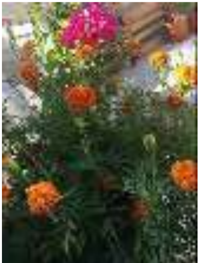
Our gardens have produced flowers, tomatoes, potatoes, capsicum, chilis and zucchini. Thanks to the hardworking gardeners!