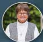
Sr. Helen Prejean, CSJ, Anti-death penalty visionary