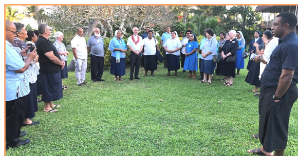
CMSPI singing "Isa Lei" to farewell the Nuncio.