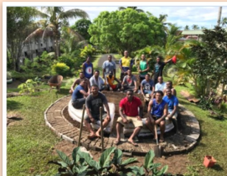
Earthbag technology for making raised beds