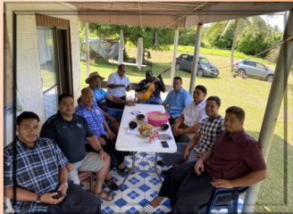
The Tonga Sector confreres with the "Come and See" candidates in their Vocation weekend program.