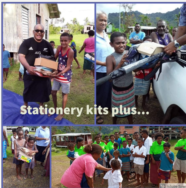
Stationery kits plus...