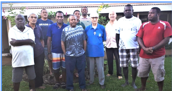
The confreres in the Vanuatu Sector