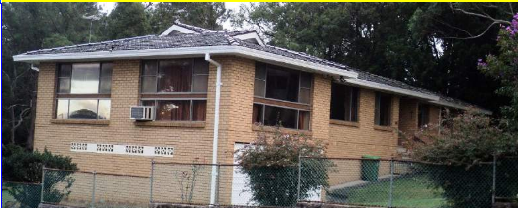
13 Rocher Avenue, Hunters Hill: "Oceania House" for 45+ Years

"they strive to become .. ever more effective "instruments of divine mercy" C. 11