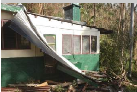
Tutu : One of 22 damaged buildings