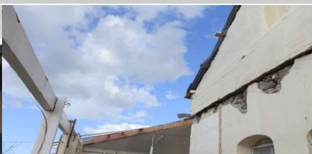
Presbytery of Wairiki