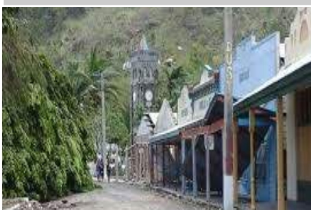
Levuka Town : Church at the back