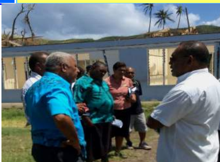
Prime Minister Bainimarama visits Cawaci - Presbytery and church at the back.