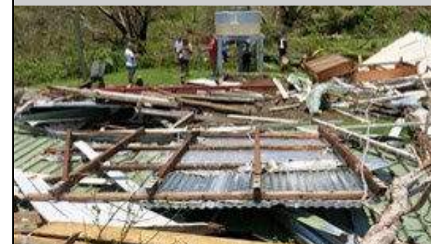
Dawasamu Holiday House

Bank: Westpac banking corporation, 1Thompson St, Suva, Fiji.